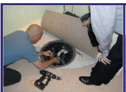
▲ Pump chamber maintenanœ by Basetec