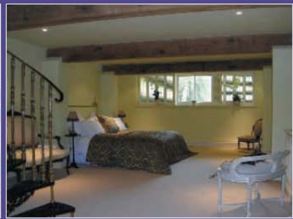
▲ The completed bedroom