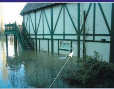
★ Rear pump outlet