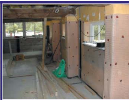
▲ Screen laid

All joints in membrance were overteped for added security