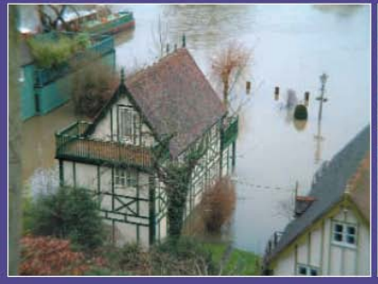
▲ The flooding - view from above