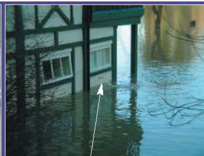
▲ Front pump outlet